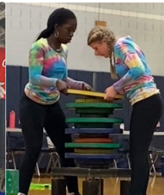
DVMS Structure Team