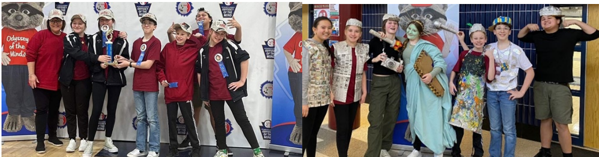
DVMS Technical Team – 1 st Place

DVMS 2023 KING & QUEEN OF KINDNESS: February is Random Acts of Kindness Month. DVMS hosts a King and Queen of Kindness where students are nominated by teachers and voted on by students to showcase students who emulate our school culture that includes positive choices, good citizenship and caring about others and our school. DVMS 2024 King and Queen of Kindness are: