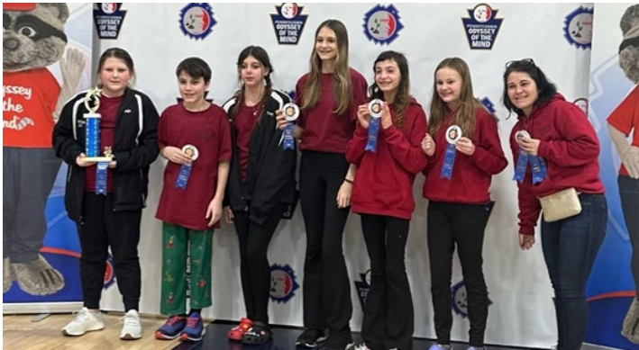
DVMS Vehicle Team – 1 st Place

HITTING THE TRIFECTA: Triple congratulations go out to our DVMS Odyssey of the Mind teams, who are all moving on to State Finals at Pocono Mountain East High School on Saturday, April 6th . At the NEPA Odyssey of the Mind Regional Tournament on February 24th, our technical and vehicle teams each came in first place for their problem and division and our structure team (who held a whopping 415 pounds on a 15 gram balsa wood structure) came in third place . Way to go Omers and good luck at States!